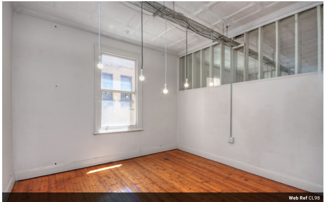
Web Ref CL98

Block C Investment Place, 110 10th Rd, Hyde Park, Johannesburg, Gauteng